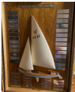
The U.S. Nationals trophy is now housed in Mystic, Conn.